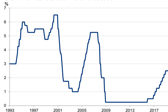
U.S.: the first rate cut in over a decade!

The Federal Reserve ("Fed") cut its leading rate by 0.25% in July, a decision that was eagerly awaited by financial markets. During the press conference, Fed president Jerome Powell explained that this decision reflected a mid-cycle adjustment of the monetary policy and should not be interpreted as the start of a long leading rate reduction cycle. The Fed indicated that it continues to work toward sustained expansion of economic activity, but estimates that monetary easing is justified at this time. According to Powell, the U.S. domestic economy is doing well, with its strong labour market; however, an insurance policy against increased trade tensions was necessary.