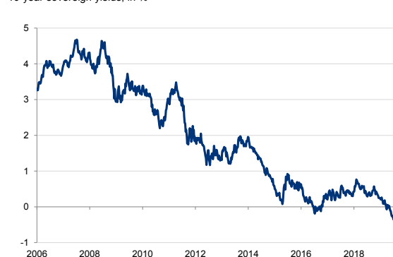
Germany: interest rates now at historic lows 10-year sovereign yields, in %

The general decrease in interest rates continues around the globe, so much so that approximately 14 trillion (thousand billion) U.S. dollars worth of sovereign bonds is trading at negative rates. Germany's 10-year rates dropped to a historic low of -0.47% whereas 30-year rates are heading straight to 0%. This generalized downward movement of interest rates is a result of trade tensions, the primary risk currently weighing on global economic perspectives, and the simultaneous reaction of the major central banks, which have done an about-face and are now in monetary stimulus mode.